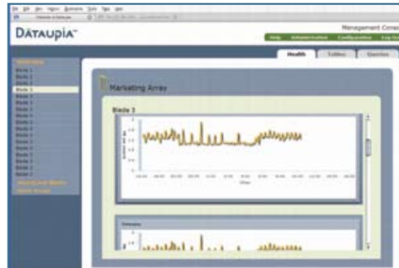
The Dataupia Management Console provides a centralized view and powerful tools for maintaining server environments.